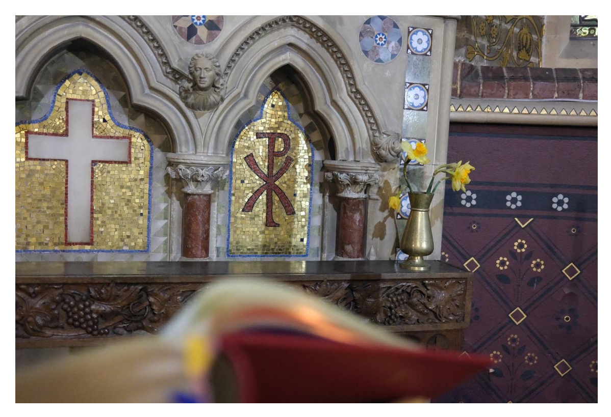
Other reports to be shared in person...